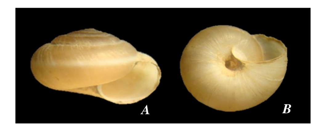
Figure 1. Archaica eleorika: A - general view of the shell; B - view from the posterior side of the shell

The whorls of the shell are 5.5 in number, gradually increasing in size, with the final whorl descending abruptly towards the aperture. The color of the shell is liver-colored, with a pale ochre band present at the lower part. The sculpture on the shell surface is well-developed, consisting of fine spiral grooves. The apex is sometimes covered with mossy vegetation, which gradually disappears over time. The aperture of the shell is slightly oblique, with the lip of the aperture variably thickened. The lip of the aperture does not approach closely to each other. The columellar part of the aperture is slightly twisted, forming a partial barrier to the cylindrical body whorl.